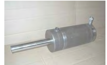
Mill type Hydraulic Cylinder