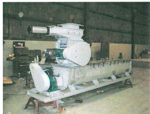
Stainless steel ash mixer

Whether your job requires fabrication, machining, or assembly, A&G Mfg. Co. inc. has the facilities, equipment, and personnel to manufacture accurately-on schedule-and at a reasonable price.